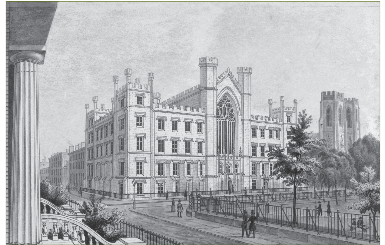
New York University (then known as University of the City of New York), Washington Square, 1850, where Root studied law.

himself, towards the end of his career, indicted on antitrust charges as a director of the Sugar Trust.)