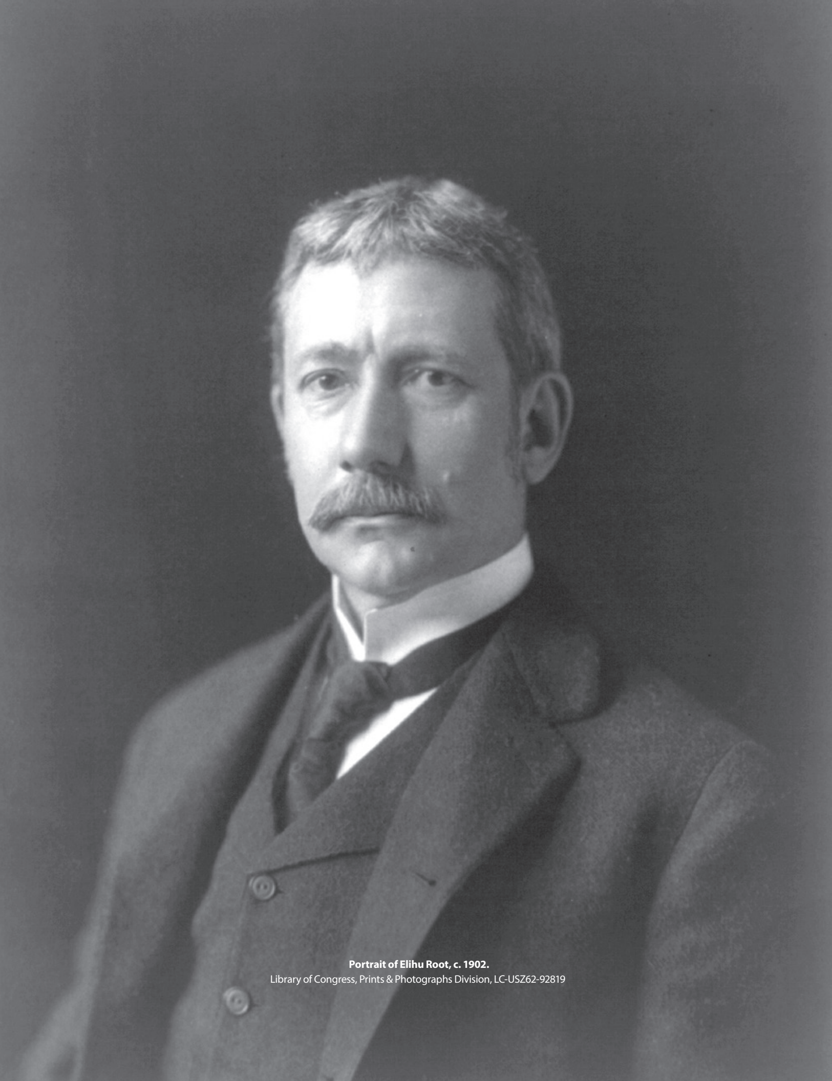
Portrait of Elihu Root, c. 1902.

Library of Congress, Prints & Photographs Division, LC-USZ62-92819