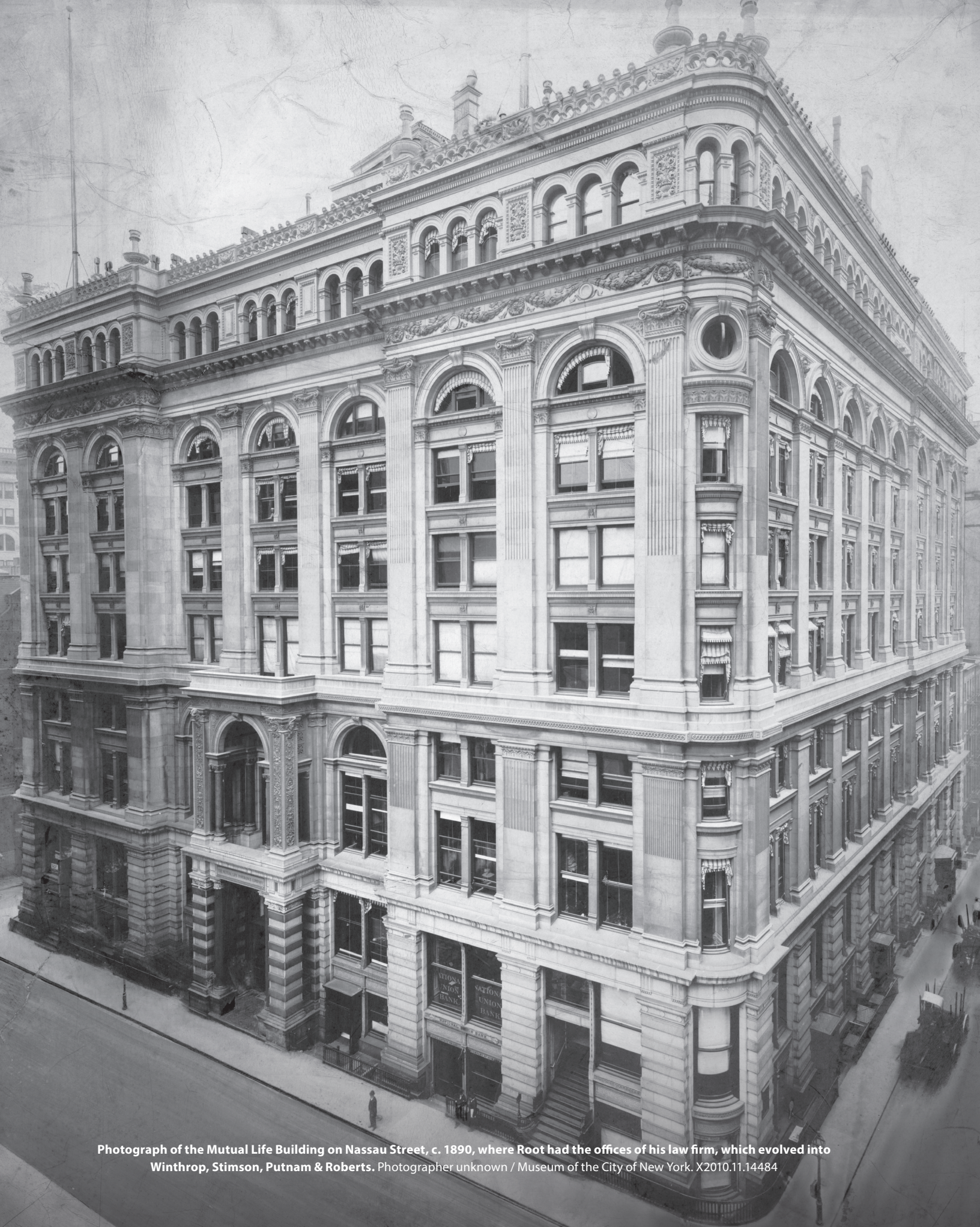
Photograph of the Mutual Life Building on Nassau Street, c. 1890, where Root had the offices of his law firm, which evolved into Winthrop, Stimson, Putnam & Roberts.