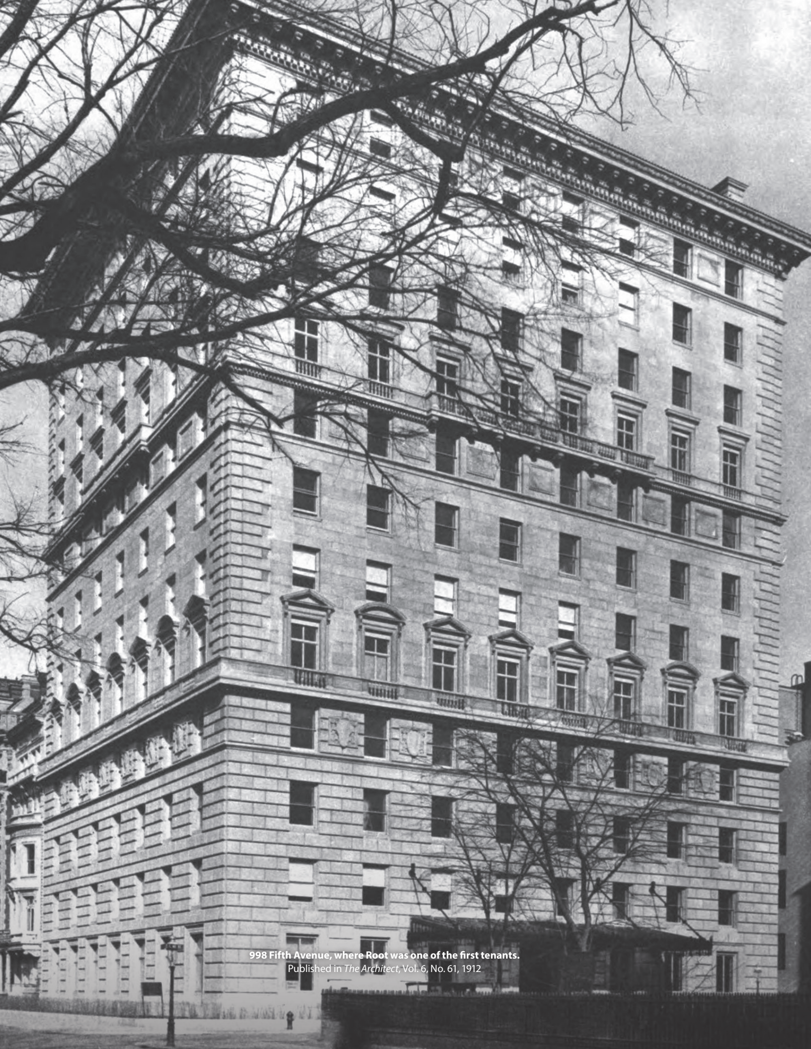
998 Fifth Avenue, where Root was one of the first tenants. Published in The Architect , Vol. 6, No. 61, 1912