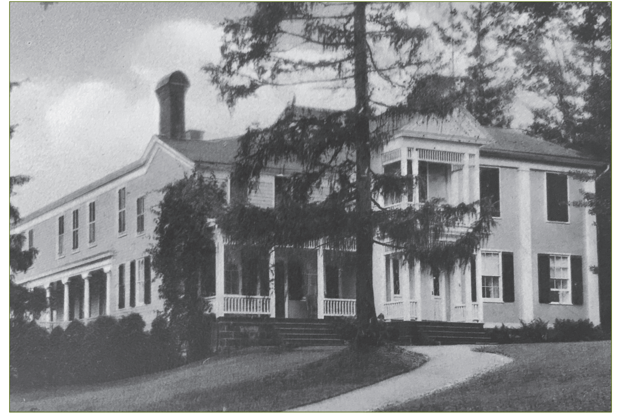
Root's summer home in Clinton, NY.

in 1889; however, that never materialized. In 1897, Root formed the firm Root, Howard, Winthrop & Stimson with offices in the Mutual Life Building at the corner of Nassau and Liberty Streets. This firm grew into Winthrop, Stimson, Putnam & Roberts, one of New York City's venerable "white shoe firms," which merged in 2001 with a large San Francisco firm to become Pillsbury Winthrop. Root remained with the firm until 1899, when he was appointed Secretary of War by President McKinley.