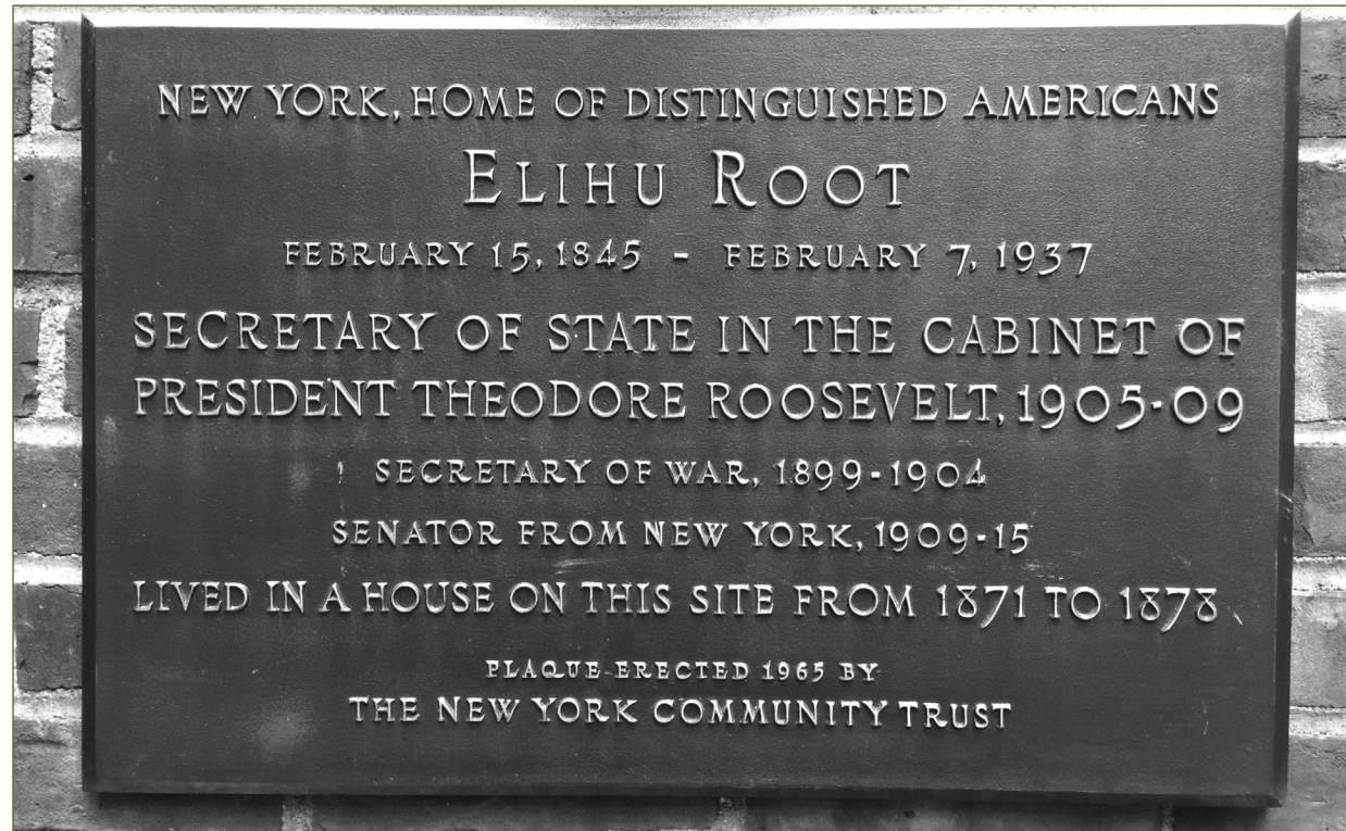
A plaque highlighting Root's residency at 22 Irving Place.

and Washington, having been elected United States Senator from New York in 1909. (Despite his lengthy career in government, Root never campaigned for public office; U.S. Senators were still elected by state legislature at the time, and his other positions were all appointive.)