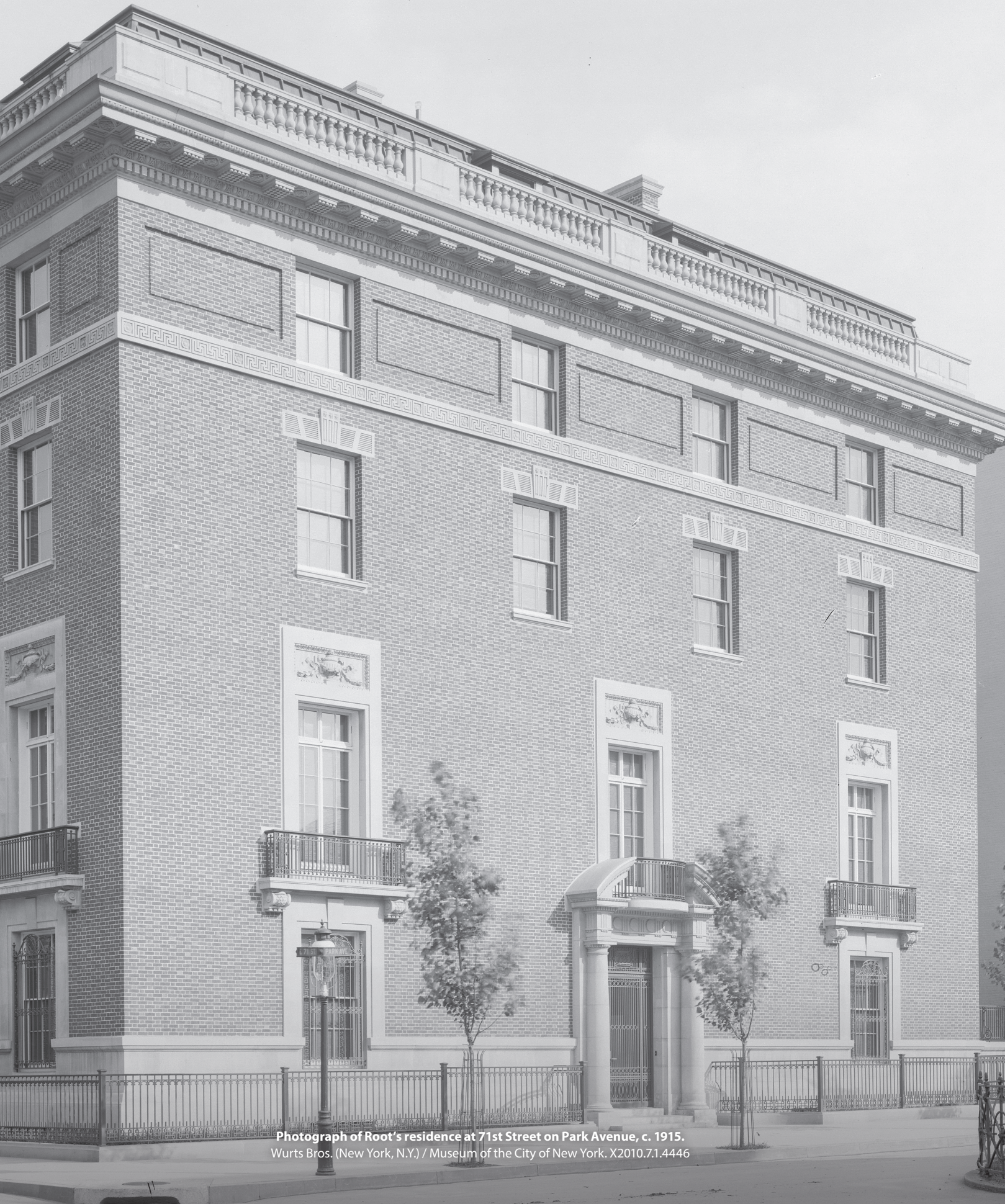
Photograph of Root's residence at 71st Street on Park Avenue, c. 1915.